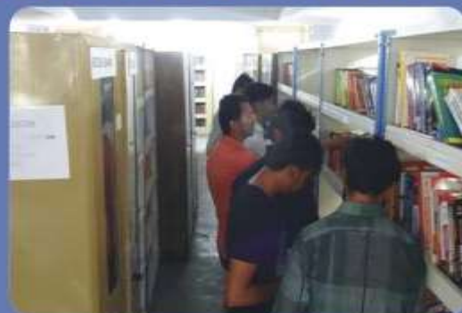
Open Shelf System