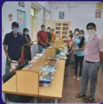
Book-Bank Facility for needy students